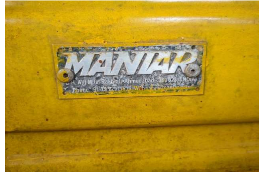
Make name plate