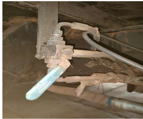
Flow control valve