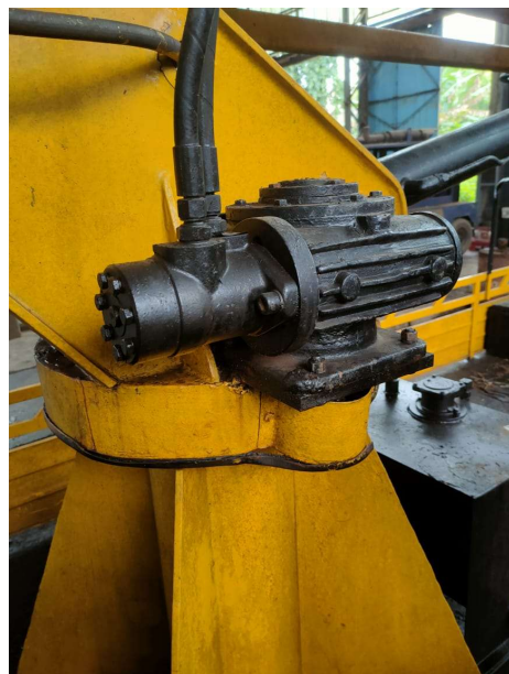
Radial Gear box