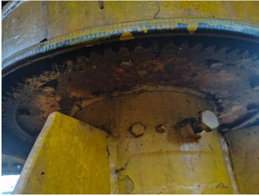
Radial Gear teeth