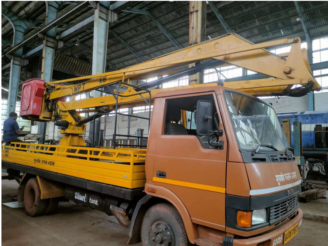
Ladder Mounted Crane