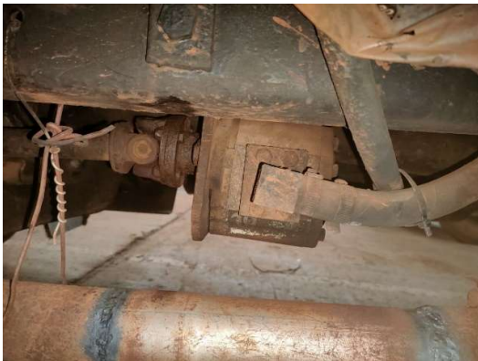
Main Oil Pump