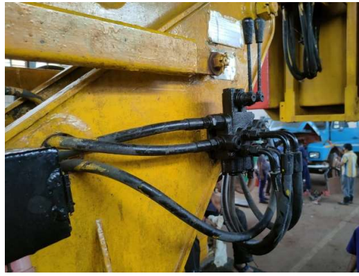
Boom Control Valve