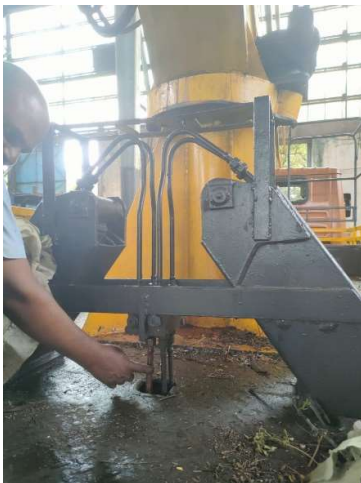
Side leg Control valve hydraulic tube