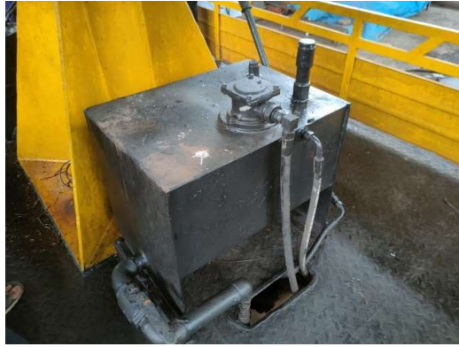
Main Oil Tank