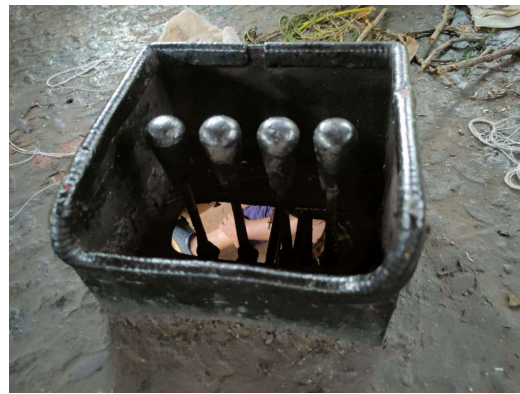
Leg side Control Valve