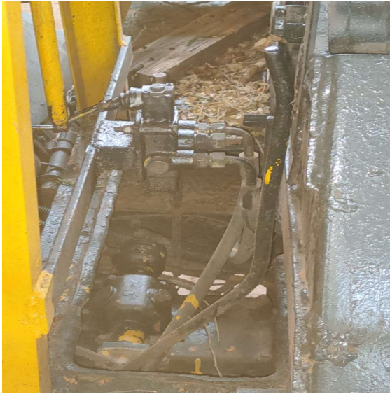
Main tank hydraulic Control valve