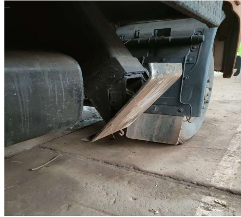
Side leg side 4 nos.